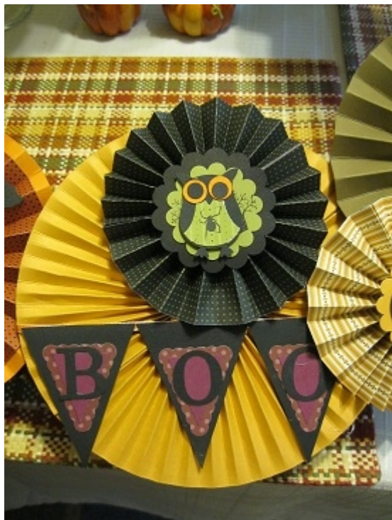
Boo Pennant Rosette