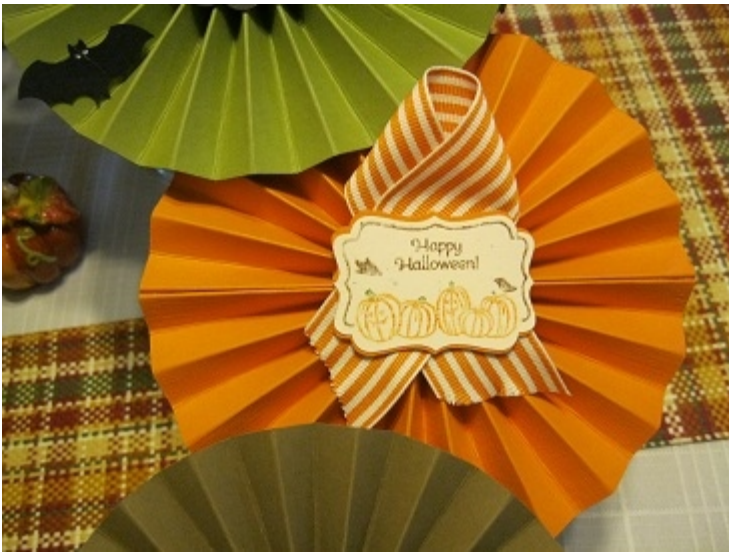
Happy Halloween Rosette

3" x 1/2" scored rosette - Pumpkin Pie c/s Cajun Craze 1-1/4" striped grosgrain ribbon Stamps: Gift Givers (Holiday Mini) Decorative Label punch - Confetti Cream c/s and Pumpkin Pie Decorative Label punch halves layered behind. Pumpkin pie, Chocolate Chip, and Old Olive Markers used to ink stamp.