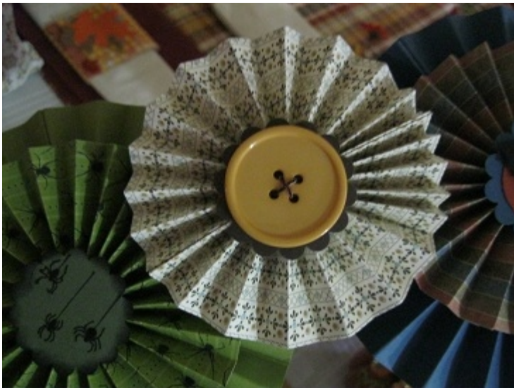
Big Button Rosette

3" x 1/2" scored rosette - Old Olive c/s 2" x 1/2" scored rosette - Frightful Sight DSP Scallop circle punch - Old Olive c/s sponged in black Stamps: Out on a Limb - 3 spiders in black image