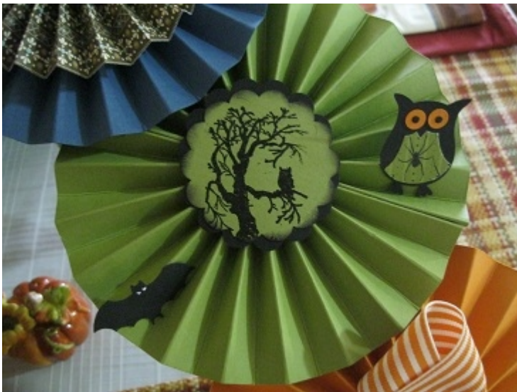
House of Haunts Rosette

3" x 1/2" scored rosette - Not Quite Navy c/s 2" x 1/2" scored rosette - Spice Cake DSP Scallop circle punch - Chocolate Chip c/s 1-3/8 circle punch - Marina Mist c/s Large Early Espresso button White bakers twine colored with Not Quite Navy Marker