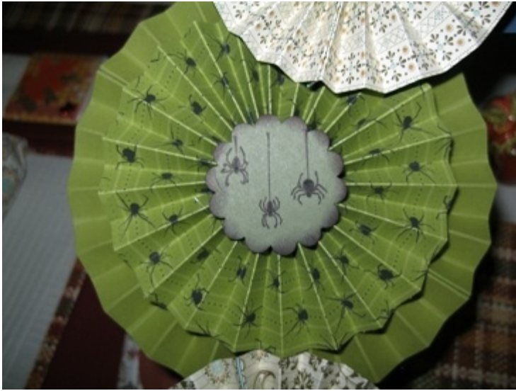
Three Hanging Spiders Rosette

3" x 1/2" scored rosette - Old Olive c/s 2" x 1/2" scored rosette - Frightful Sight DSP Scallop circle punch - Old Olive c/s sponged in black Stamps: Out on a Limb - 3 spiders in black image