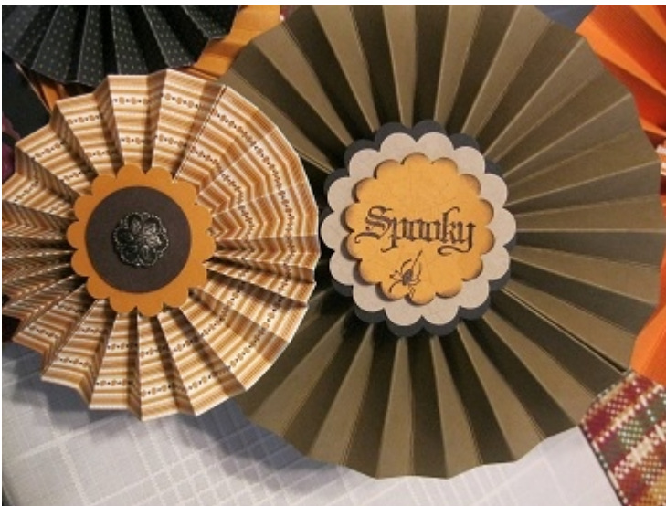
Spooky & Antique Brad Rosettes

3" x 1/2" scored rosette - Pumpkin Pie c/s Cajun Craze 1-1/4" striped grosgrain ribbon Stamps: Gift Givers (Holiday Mini) Decorative Label punch - Confetti Cream c/s and Pumpkin Pie Decorative Label punch halves layered behind. Pumpkin pie, Chocolate Chip, and Old Olive Markers used to ink stamp.